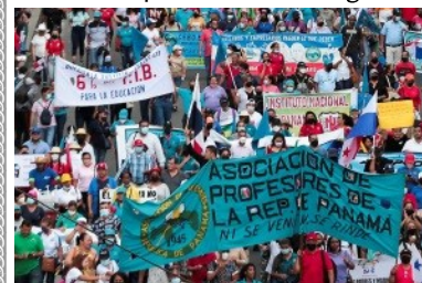
Protesters Out in Force

During the summer, there was a lot of unrest in Panama with a large number of protests occurring.