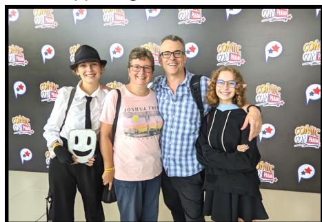
Comic-Con came to Panama City

It has been 9 months since we arrived (gasp!) and we thought we would bring you up to date with the latest happenings here in Panama.