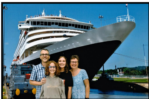
We went to visit the Panama Canal—Woo!