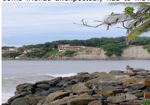
Panama has some very dramatic coastline

Though living in Panama is not without its challenges, we are giving thanks for the things God is giving us. Friendships, opportunities to minister and tangible blessings are just a few. For example, with the collapse of the pound against the dollar we, at one point, saw our income down by nearly a third! But then some friends unexpectedly had to move